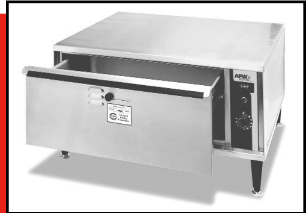
MODEL HDD-1 COUNTERTOP HOLDING DRAWER