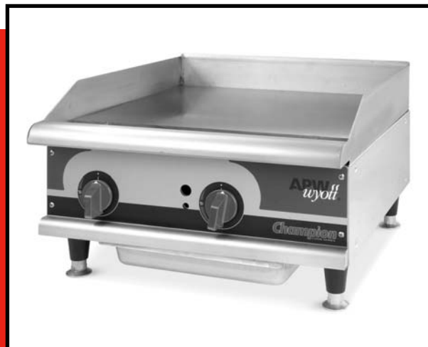
Model GGM-24H Gas Manual Griddle