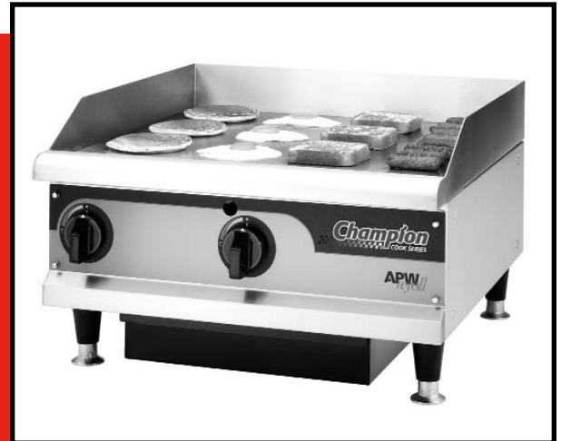
Countertop Electric Griddle