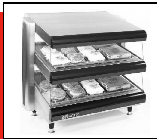
RACER™ DOUBLE SLANTED MERCHANDISER