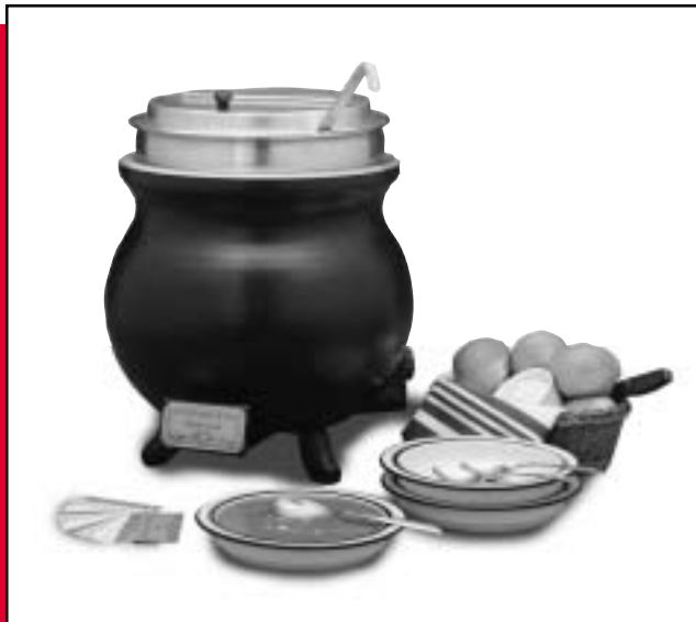
COUNTERTOP ROUND KETTLE SERVERS